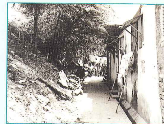
Backlane behind Amoy Street shophouses in the past.