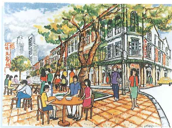
What it will be like in the future.