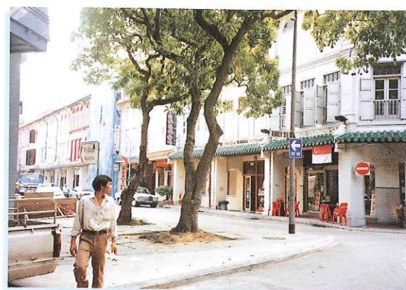
Amoy Street today.

With its rich history, five national monuments and charming conservation shophouses, Kreta Ayer and Telok Ayer are interesting places to explore on foot. However, the walkways in these two areas today are not continuous and certain stretches of the route are neither easily accessible nor conducive for pedestrians to walk.